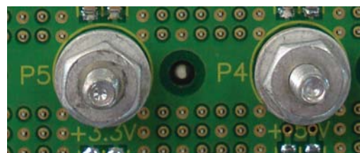
Close-up of 6-32 Power Studs