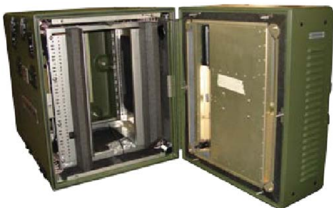
Image shows compressor air conditioning unit fitted into an insulated aluminum E-Rack.