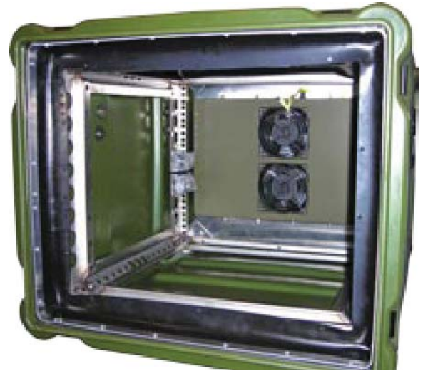
Images shows roto-molded 8U Amazon racks fitted with a thermoelectric 1500BTU cooler and protective skirt.

A full air conditioning brochure is available upon request.