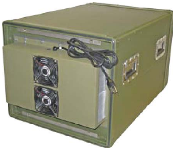
Image shows aluminum E-Rack

Thermoelectric coolers do not require ventilation in the outer container, this helps maintain the IP rating of the rack.